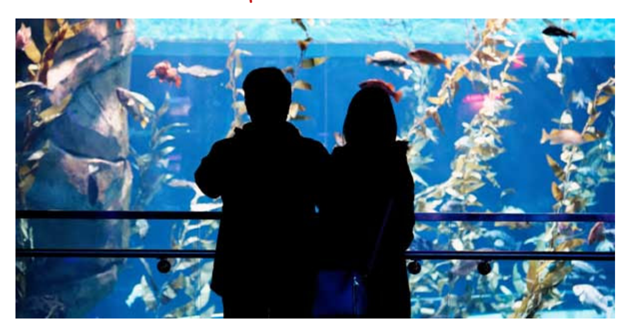
Unifor welcomes its newest members at Ripley's Aquarium in Toronto where workers voted by 70% in favour of joining the union last week.