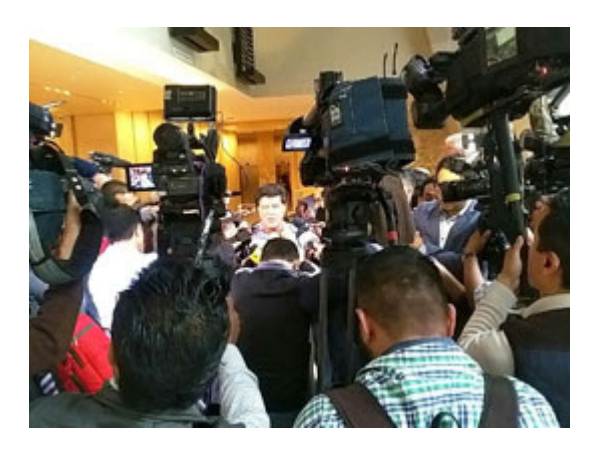
Unifor condemns the violence against journalists during the attack on the U.S. Capitol.